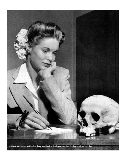
Figure 1: Photo from Life magazine

In particular conditions, even in mature democracies the collective paranoid element can silence reason. John W. Dower (Dower, 1986) has analyzed how, in some respects, the War in the Pacific was a continuation of the "war between races" practised during the nineteenth century in the West. Thus, among Americans and Japanese it became "normal" to remove parts of the body, as had happened in the past with the practice of "scalping". This photograph (Fig. 1), in which a white middle-class woman thanks her marine fiancé for sending her the skull of a Japanese, was published in Life , a staid bourgeois weekly.