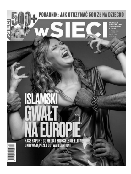
Figure 4: Magazine Images

The problem does not derive from sexual violence, but from the paranoid imagination. So it is no coincidence that it activates the image of the white woman contaminated by the dark skin: an archaic projection of evil, which history has often associated with lynching.